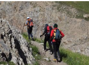
Achik-Tash Base Camp (3600 m) - ⌚ 6h Petrovsky Peak Achik-Tash Base Camp (3600 m)