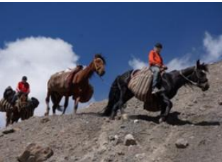
Achik-Tash Base Camp (3600 m) 12km - ⌚ 6h Camp N°1 Lenine