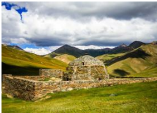
Son Kul lake 📍 🚗 260km - ⌚ 5h Tash Rabat 📍