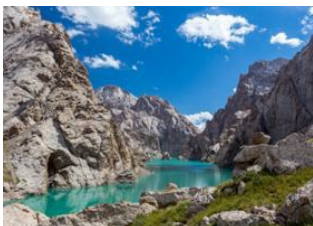
Tash Rabat 📍 🚗 230km - ⌚ 6h Kel-Suu 📍