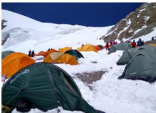
Camp N°1 Lenine 📍 5km - ⌚ 8h Camp N°2 Lenine 📍