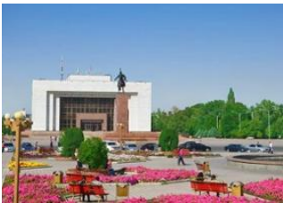
Manas airport 📍 🚗 30km - ⌚ 40m Bishkek 📍