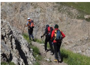
Achik-Tash Base Camp (3600 m) - ⌚ 6h Petrovsky Peak Achik-Tash Base Camp (3600 m)