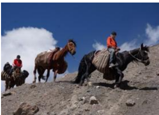
Achik-Tash Base Camp (3600 m) 12km - ⌚ 6h Camp N°1 Lenine