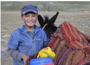
Achik-Tash Base Camp (3600 m)