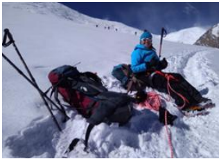
Camp N°2 Lenine 📍