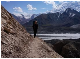
Camp N°1 Lenine 📍 - ⌚ 5h Domashni and Yuhin Peaks ( 5100 m) 📍 Camp N°1 Lenine 📍