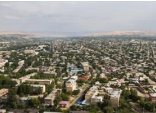
Achik-Tash Base Camp (3600 m) 🚗 290km - ⌚ 9h Osh