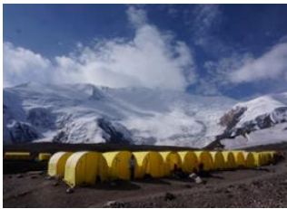
Camp N°1 Lenine 📍