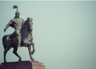
Osh ✈ 600km - ⌚ 40m Bishkek