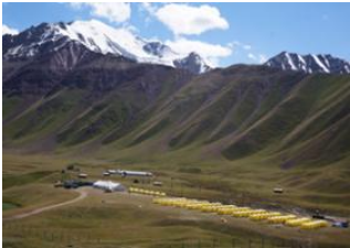
Bishkek 📍 ✈ 600km - ⌚ 40m Osh 📍 🚗 290km - ⌚ 8h Ashik-Tash Base Camp (3600 m) 📍