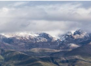
Bishkek 🚗 30km - ⌚ 40m Manas airport Departure