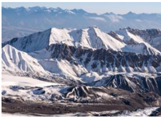
Achik-Tash Base Camp (3600 m) 📍