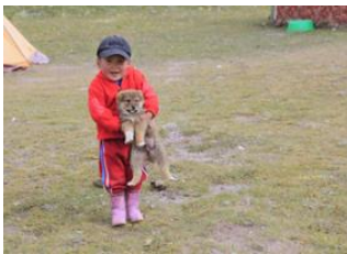
Camp N°3 Lenine (6100m) 📍