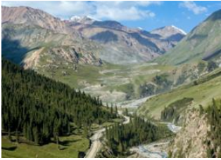
Kashka-Suu Lake 📍 15km - ⌚ 6h River Kumtor 📍