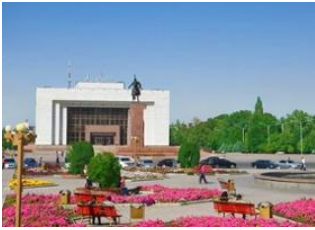
Bokonbayevo 📍 🚗 280km - ⌚ 5h Bishkek 📍