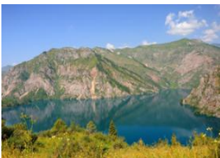
Kashka-Suu Pass ♡