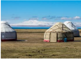
Tash Rabat 📍 🚗 190km - ⌚ 5h Son Kul lake 📍