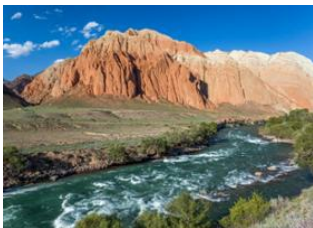
Son Kul lake 📍 🚗 140km - ⌚ 3h 40m Kyzyl-Oi 📍